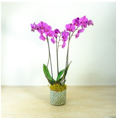
Triple Stem Orchid

Now available in purple and yellow, the elegant blooms of the orchid plant make a great gift for any occasion.