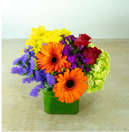
Bold n' Beautiful $55 | $75 | $100 [177B10]

A bunch of tulips paired with viburnum in a keepsake vase that mom can use again and again. Complete the gift and add a Sugarfina Cocktail Kit!