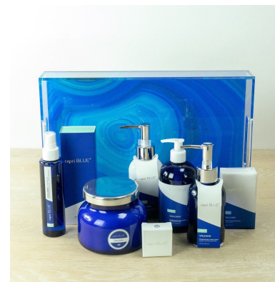
Complete Capri $180 [119B19]

Everyone loves Tiffany Blue, and this pairing is no different. Louis Sherry chocolates combined with Lux's Blue Hydrangea candle.