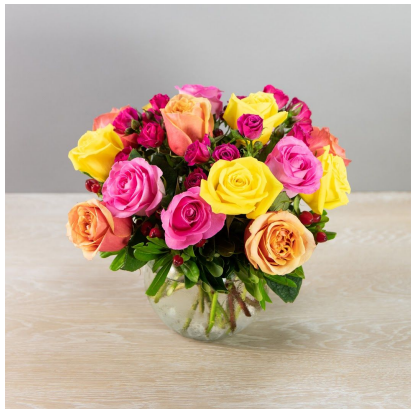
Rose Sorbet Bubble Bowl $65/$85/$100 [206B10]

Roses, lilies, gerbera daisies, and bupleurum come together to form this gorgeous bouquet in bright melon tones.