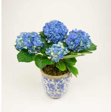
Arkansas Grown Hydrangea in Decorative Container