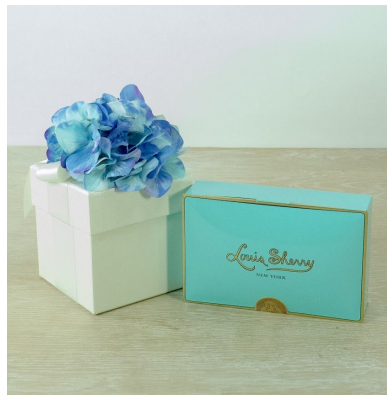
Tiffany Blue $80 [129B19]

This basket is perfect for a chocolate lover! Indulge in an assortment of chocolate treats!