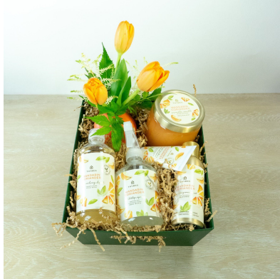
Thymes Mandarin Coriander Basket