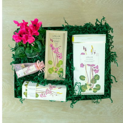
Lollia This Moment Basket

This one-of-a-kind herbal and citrus blend is like a breath of fresh air. Including countertop spray, home fragrance, dish soap, a candle, and hand creme made with biodegradable cleansing agents - extracts of fennel and parsley effectively clean, while putting a refreshing touch on the surfaces of your home.