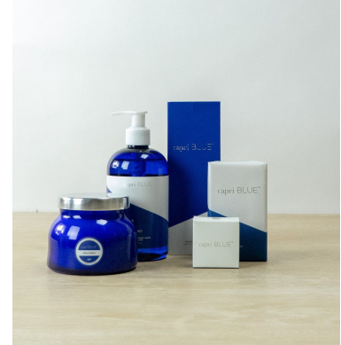
Classic Capri $80 [121B19]

All the essentials (hand soap, lotion, bar soap, and hand creme) in our Thymes Lavender Scent wrapped up together for the perfect gift for your Lavender Lover!