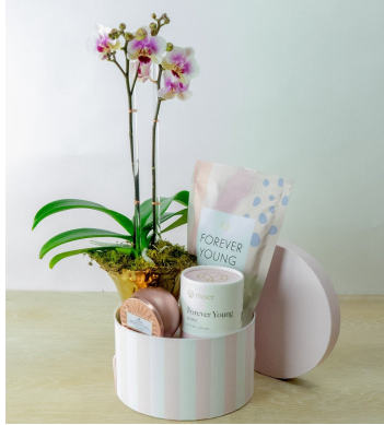
Forever Young $100 [132B19]

A sophisticated bath set featuring a miniature orchid, Musee Bath Salts, Bath Bomb, and a Voluspa Candle.