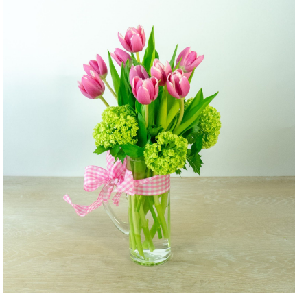
Sippin' Pretty $40 | $55 | $70 [265B20]

A bunch of tulips paired with viburnum in a keepsake vase that mom can use again and again. Complete the gift and add a Sugarfina Cocktail Kit!