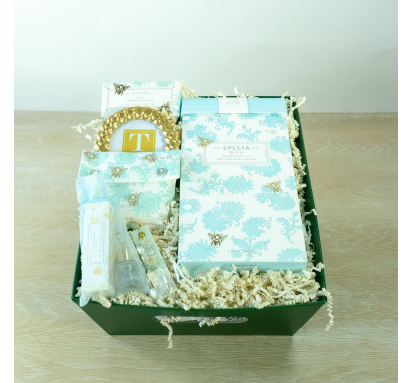
Lollia Wish Basket

Botanical bliss. Lose yourself in a luxurious delightfully fragranced & richly relaxing scent that soothes the senses with uplifting notes of Water Lily, Sun Blossoms, Aquatic Greens, Sweet Grass & Honey Amber. Includes reed diffuser, soap, bath salt, and pocket hand creme and perfume with a few extra treats.