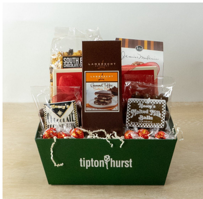
Chocoholic Basket $60 | $75 | $100 [535B10]

Everything you need to set up your Capri Blue fan's Volcano collection - a candle, hand soap, bar soap, a bath bomb, and room fragrance.