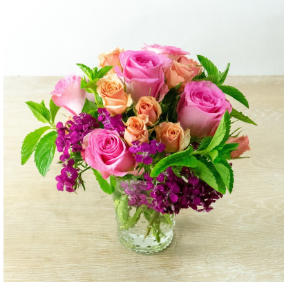
Mrs. Gernice $50 | $60 | $75 [287]

You'll make anyone feel special with this bright and cheery rose arrangement! Including a mixture of sorbet colors, these roses are complimented with coffeeberry and arranged in a bubble bowl.