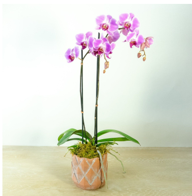
Double Stem Orchids

The classic and elegant triple-stemmed orchid plant is a great gift that continues to bloom and grow for years to come.