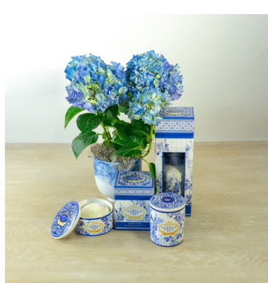
Portus Cale Basket

This basket is filled with a candle, potpourri, room spray, wax melt, and more to take you to the tropics. Pomelo and Pomegranate is comprised of a sweet citrus blend of oroblanco pomelo and pomegranate musk infused with a hint of clementine blossoms.