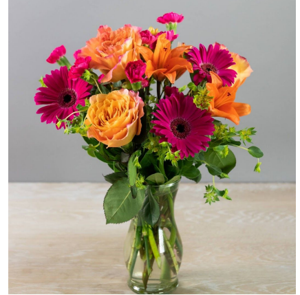
Just Happy $40 | $50 | $60 [223B10]

A bright medley of gerbera daisies, roses, lilies, hydrangea, and statice in cheerful colors arranged in a cube vase.