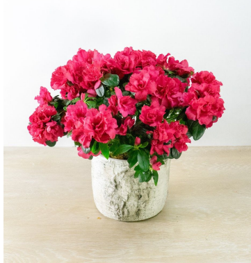
Arkansas Grown Azalea Plant

Make a big impact with a beautiful hydrangea in a decorative container.