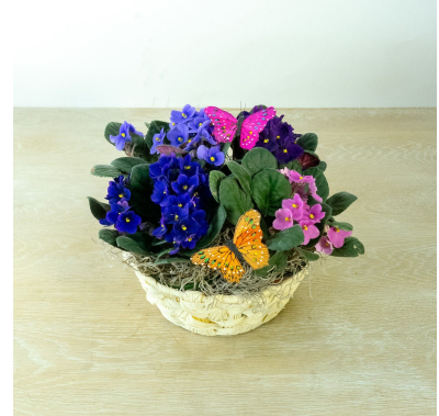
African Violet Basket

The classic & elegant orchid plant is a great gift that continues to bloom & grow for years to come - now in miniature.