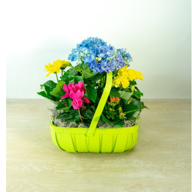
English Garden Basket

This gorgeous plant displays the delicate flowers that give a perennial pop to any space that needs a little perking up!