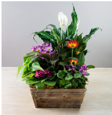
European Garden Basket

4" blooming plants in assorted colors in a keepsake basket.