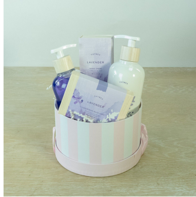
Thymes Lavender $70 [115B19]

A sophisticated bath set featuring a miniature orchid, Musee Bath Salts, Bath Bomb, and a Voluspa Candle.