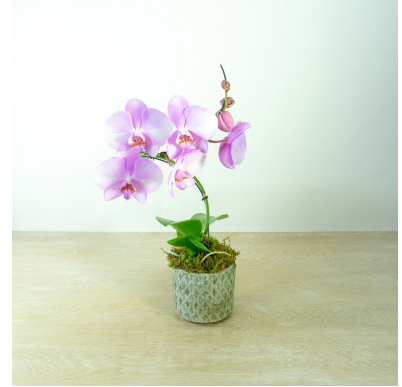
Spiral Stem Orchids