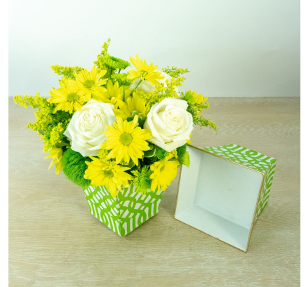
This Little Light of Mine $80 $65 [428B20]